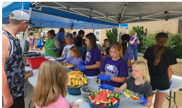
Area students spend an afternoon volunteering at SKC

As an organization, we are also excited to start developing stronger relationships with our area schools. This coming fall we will be working with 5th-grade students across the entire county on ways they can give back by utilizing their time, talents, and treasures helping them build strong ties to their communities and understanding that even the largest trees start from tiny seeds.