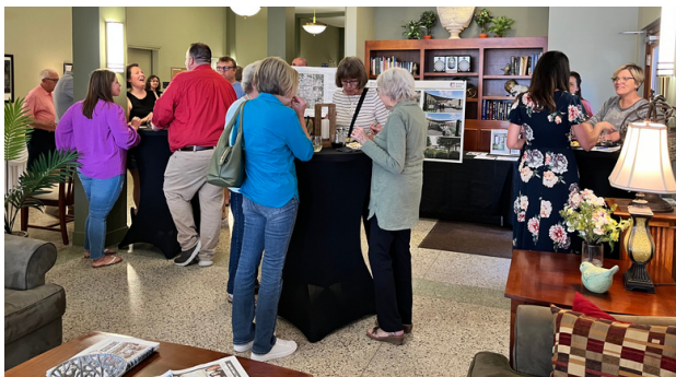
After Hours event hosted by SVCF in May 2023

Over the last ten years, we have undoubtedly grown as an organization. Both in terms of monetary impact and grants given, but also in knowledge, experience, leadership, and relationships. We have forged partnerships with local businesses, philanthropists, organizations, and passionate individuals who share a common desire to enhance and promote the quality of life within our communities. The exciting part is, we're just getting started!