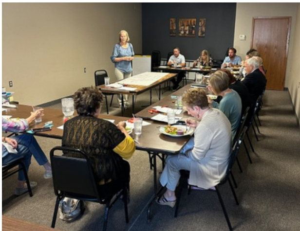
SVCF Board during a strategic planning session, Sept 2023

Leading up to, and throughout this past year, our board has taken the opportunity to not only reflect on the accomplishments of the past but also cast a vision and strategic plan for the future.