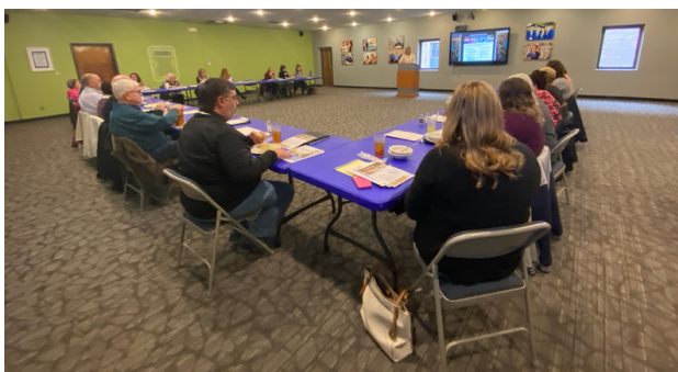
Non-Profit meetup, March 2023

As a foundation, we recognize the value and importance of the work our area non-profits provide. In the coming year, and consecutive years to come, our Leadership Capacity Committee will be focusing on ways to better support our non-profits and the work they do. We have since started hosting a non-profit roundtable in the fall, and a meetup in the spring. During these times area non-profits come together to share about the initiatives they are working on, and the difficulties they are facing allowing time for networking, support, and overall connection and collaboration. During our spring meetups, SVCF provides tools, resources, and information pertinent to the non-profit world. This past spring, in preparation for a new Give to Grow Day initiative, SVCF presented information on organization funds and the benefits they can provide.